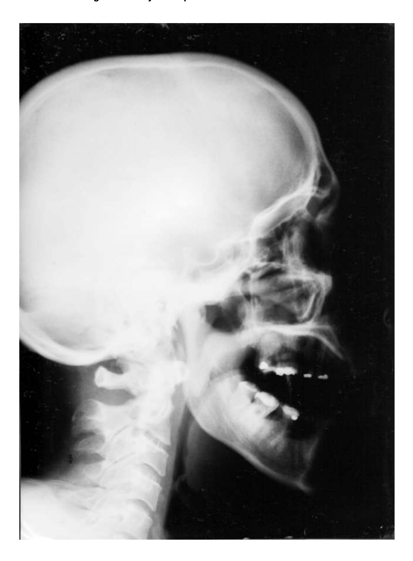
Figure 2 - X-ray of the patient without the SnoreMender